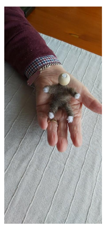
Shepherds (not completed yet) for "shepherd on the shelf"- adapted from <a href="https://shepherdonthesearch.com/">https://shepherdonthesearch.com/</a>